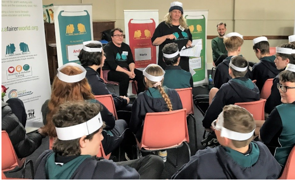
Image description: Students from Hobart City High participating in the 'crown' activity which gives them a taste of exclusion.

A Fairer World designs and delivers transformative school programs that are informed by research and focus on the connections between school climate (culture), student wellbeing and learning outcomes. We recognise that when students feel unsafe, marginalised, or not included at school, they are less likely to attend, more likely to display disruptive behaviours and their academic attainment is lowered.