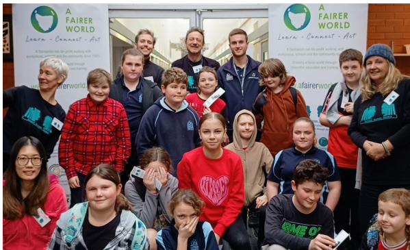
Image description: Mountain Heights School students pose with human 'books' and A Fairer World staff.

848 students attended Inclusion Forums in 2023