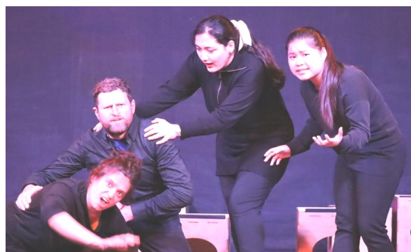
Image description: Members of Students Against Racism performing in their 'Letters I Never Sent' theatre production.